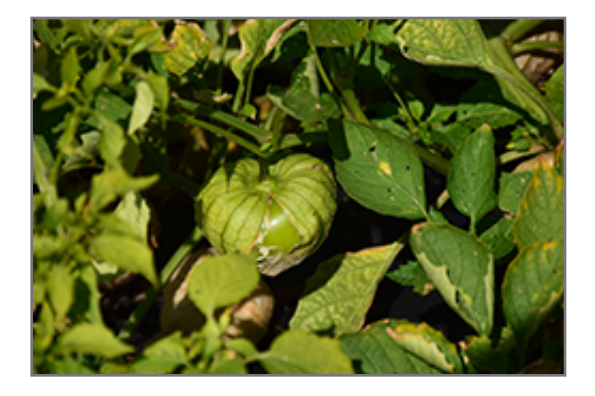
Tamayo Tomatillo fruit

heeman.ca | 519.461.1416 20422 Nissouri Road Thorndale, ON N0M 2P0 Family owned and operated since 1963. Open year-round.