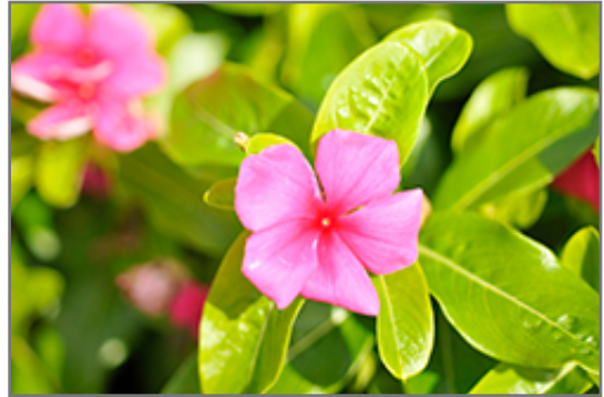
Pacifica XP Punch Vinca flowers

This plant will require occasional maintenance and upkeep, and should not require much pruning, except when necessary, such as to remove dieback. It is a good choice for attracting butterflies to your yard, but is not particularly attractive to deer who tend to leave it alone in favor of tastier treats. It has no significant negative characteristics.