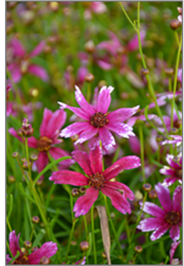
Satin & Lace Razzle Dazzle Tickseed flowers

Satin & Lace Razzle Dazzle Tickseed is recommended for the following landscape applications;