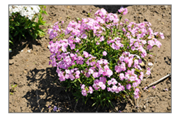
Baby Doll Pink Garden Phlox in bloom