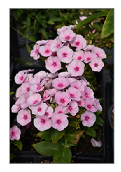
Baby Doll Pink Garden Phlox flowers