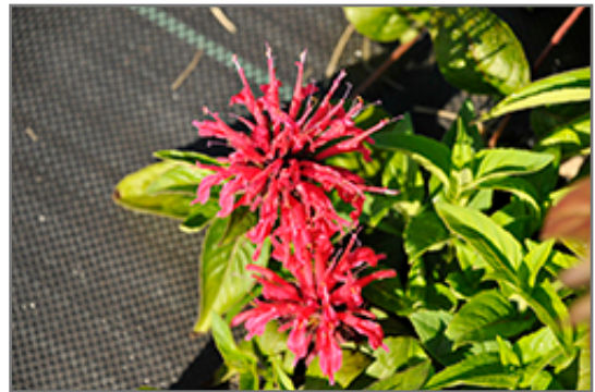
BeeMine Red Beebalm flowers