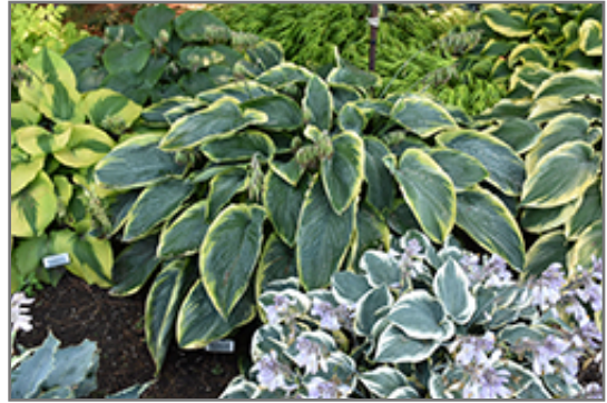
Shadowland Wu-La-La Hosta

This is a relatively low maintenance plant, and is best cleaned up in early spring before it resumes active growth for the season. Gardeners should be aware of the following characteristic(s) that may warrant special consideration;