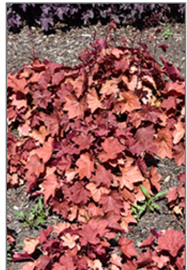
Carnival Cinnamon Stick Coral Bells