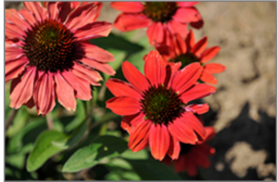
Color Coded Frankly Scarlet Coneflower flowers

Color Coded Frankly Scarlet Coneflower will grow to be about 24 inches tall at maturity, with a spread of 20 inches. When grown in masses or used as a bedding plant, individual plants should be spaced approximately 16 inches apart. Its foliage tends to remain dense right to the ground, not requiring facer plants in front. It grows at a medium rate, and under ideal conditions can be expected to live for approximately 10 years. As an herbaceous perennial, this plant will usually die back to the crown each winter, and will regrow from the base each spring. Be careful not to disturb the crown in late winter when it may not be readily seen!