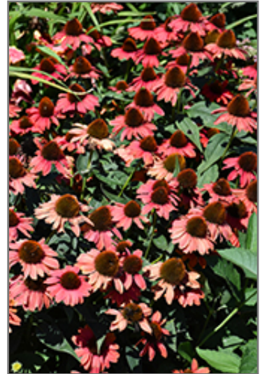
Color Coded Frankly Scarlet Coneflower flowers

This is a relatively low maintenance plant, and is best cleaned up in early spring before it resumes active growth for the season. It is a good choice for attracting bees and butterflies to your yard, but is not particularly attractive to deer who tend to leave it alone in favor of tastier treats. It has no significant negative characteristics.