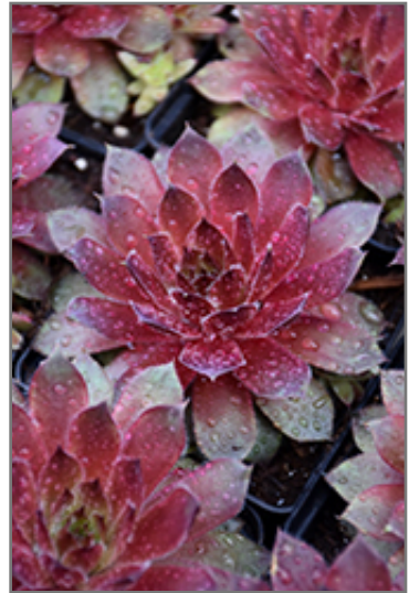
More Honey Hens And Chicks