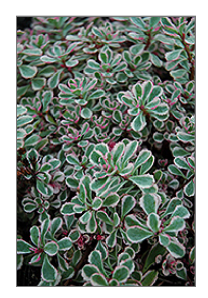
Tricolor Stonecrop foliage

Tricolor Stonecrop is recommended for the following landscape applications;