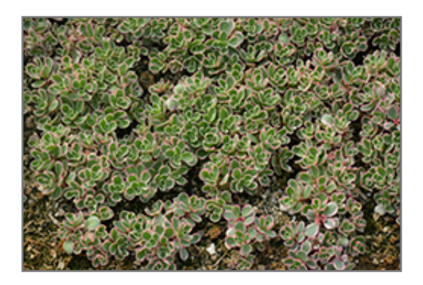
Tricolor Stonecrop flowers

Tricolor Stonecrop will grow to be only 4 inches tall at maturity, with a spread of 18 inches. When grown in masses or used as a bedding plant, individual plants should be spaced approximately 15 inches apart. Its foliage tends to remain low and dense right to the ground. It grows at a fast rate, and under ideal conditions can be expected to live for approximately 10 years. As an herbaceous perennial, this plant will usually die back to the crown each winter, and will regrow from the base each spring. Be careful not to disturb the crown in late winter when it may not be readily seen!