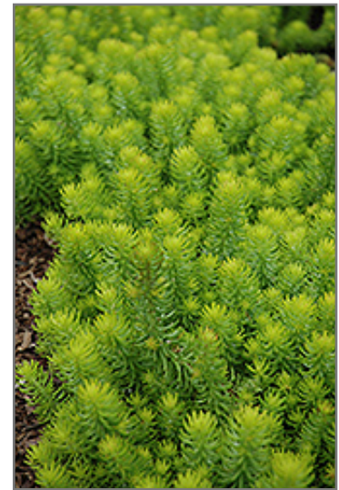
Angelina Stonecrop foliage