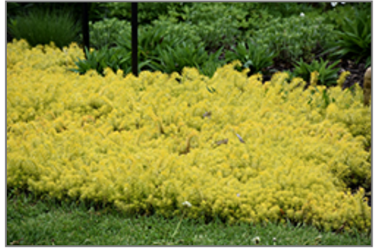
Angelina Stonecrop

This plant does best in full sun to partial shade. It prefers dry to average moisture levels with very well-drained soil, and will often die in standing water. It is considered to be drought-tolerant, and thus makes an ideal choice for a low-water garden or xeriscape application. It is not particular as to soil pH, but grows best in poor soils, and is able to handle environmental salt. It is highly tolerant of urban pollution and will even thrive in inner city environments. This is a selected variety of a species not originally from North America. It can be propagated by division; however, as a cultivated variety, be aware that it may be subject to certain restrictions or prohibitions on propagation.