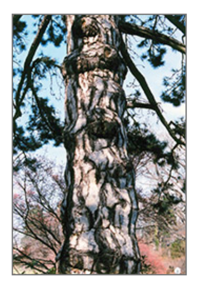
Austrian Pine bark