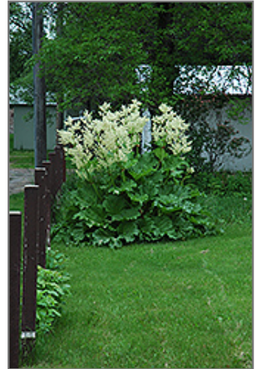
Garden Rhubarb in bloom

This is an herbaceous perennial with a rigidly upright and towering form. Its wonderfully bold, coarse texture can be very effective in a balanced garden composition. This plant will require occasional maintenance and upkeep, and can be pruned at anytime. Deer don't particularly care for this plant and will usually leave it alone in favor of tastier treats. It has no significant negative characteristics.