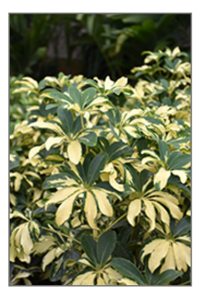
Gold Capella Schefflera foliage

When grown indoors, Gold Capella Schefflera can be expected to grow to be about 5 feet tall at maturity, with a spread of 3 feet. It grows at a medium rate, and under ideal conditions can be expected to live for approximately 10 years. This houseplant performs well in both bright or indirect sunlight and strong artificial light, and can therefore be situated in almost any well-lit room or location. It prefers to grow in average to moist soil. The surface of the soil shouldn't be allowed to dry out completely, and so you should expect to water this plant once and possibly even twice each week. Be aware that your particular watering schedule may vary depending on its location in the room, the pot size, plant size and other conditions; if in doubt, ask one of our experts in the store for advice. It is not particular as to soil type or pH; an average potting soil should work just fine. Be warned that parts of this plant are known to be toxic to humans and animals, so special care should be exercised if growing it around children and pets.