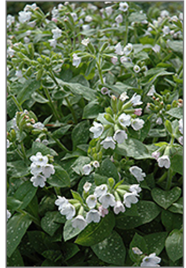
Sissinghurst White Lungwort flowers