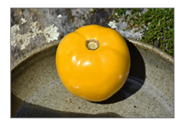
Lemon Boy Tomato fruit

heeman.ca | 519.461.1416 20422 Nissouri Road Thorndale, ON NOM 2P0 Family owned and operated since 1963. Open year-round.