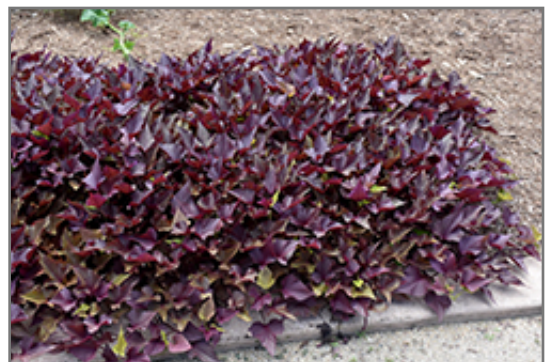
SolarPower Red Heart Sweet Potato Vine