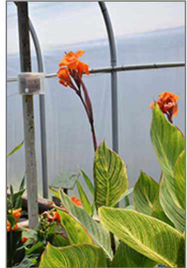
Bengal Tiger Canna flowers

This plant should only be grown in full sunlight. It requires an evenly moist well-drained soil for optimal growth, but will die in standing water. It is not particular as to soil pH, but grows best in rich soils. It is highly tolerant of urban pollution and will even thrive in inner city environments, and will benefit from being planted in a relatively sheltered location. Consider applying a thick mulch around the root zone in winter to protect it in exposed locations or colder microclimates. This particular variety is an interspecific hybrid. It can be propagated by division; however, as a cultivated variety, be aware that it may be subject to certain restrictions or prohibitions on propagation.