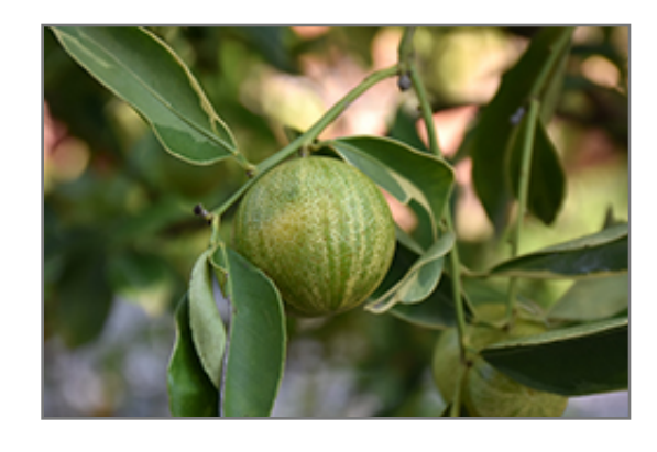
Centennial Variegated Kumquat fruit

Centennial Variegated Kumquat features showy clusters of fragrant white star-shaped flowers with buttery yellow eyes at the ends of the branches from late spring to early summer. It has attractive creamy white-variegated dark green foliage with hints of grayish green. The glossy oval leaves are highly ornamental and remain dark green throughout the winter. It features an abundance of magnificent orange berries from late fall to late winter. The fruit can be messy if allowed to drop on the lawn or walkways, and may require occasional clean-up.