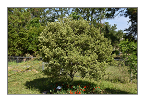
Centennial Variegated Kumquat