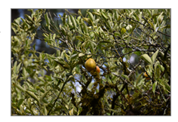
Centennial Variegated Kumquat fruit

Centennial Variegated Kumquat is a good choice for the edible garden, but it is also well-suited for use in outdoor pots and containers. Its large size and upright habit of growth lend it for use as a solitary accent, or in a composition surrounded by smaller plants around the base and those that spill over the edges. It is even sizeable enough that it can be grown alone in a suitable container. Note that when grown in a container, it may not perform exactly as indicated on the tag - this is to be expected. Also note that when growing plants in outdoor containers and baskets, they may require more frequent waterings than they would in the yard or garden. Be aware that in our climate, this plant may be too tender to survive the winter if left outdoors in a container. Contact our experts for more information on how to protect it over the winter months.