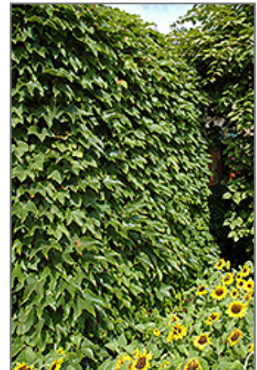
Boston Ivy