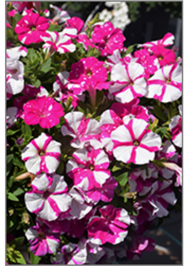
Headliner Pink Sky Petunia flowers

Headliner Pink Sky Petunia is recommended for the following landscape applications;