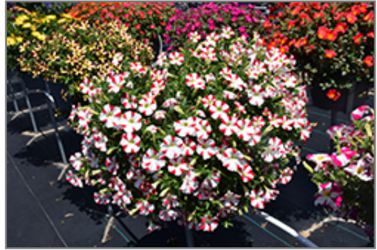
Amore King of Hearts Petunia in bloom

Amore King of Hearts Petunia will grow to be about 12 inches tall at maturity, with a spread of 14 inches. When grown in masses or used as a bedding plant, individual plants should be spaced approximately 10 inches apart. Its foliage tends to remain dense right to the ground, not requiring facer plants in front. This fast-growing annual will normally live for one full growing season, needing replacement the following year.