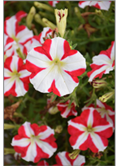
Amore King of Hearts Petunia flowers

Amore King of Hearts Petunia is recommended for the following landscape applications;