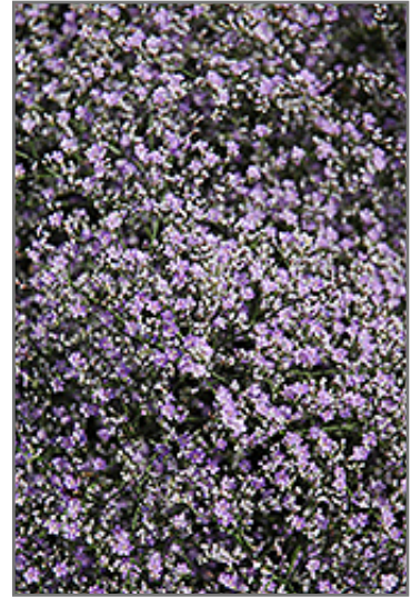
Sea Lavender flowers