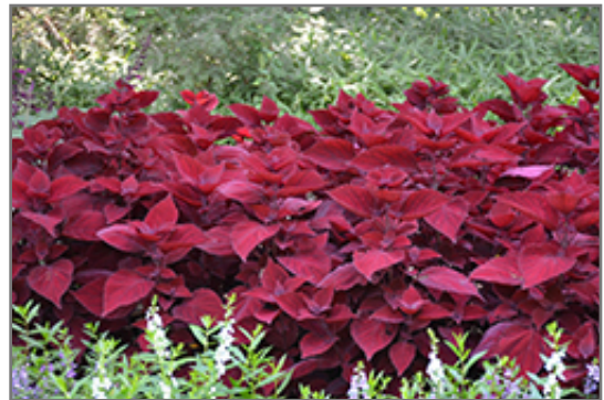
Beale Street Coleus