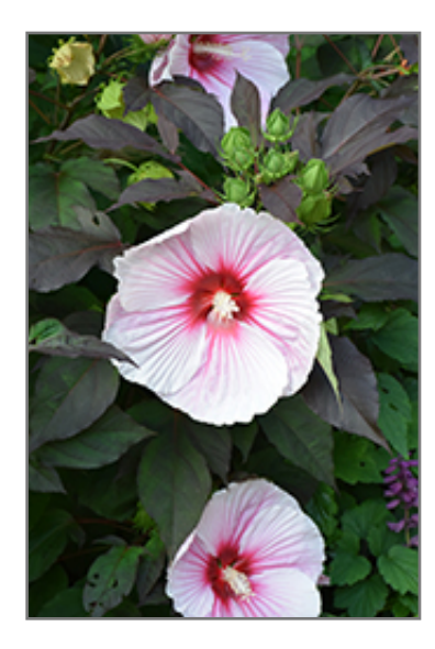
Dark Mystery Hibiscus flowers