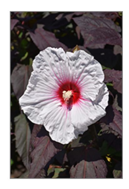
Dark Mystery Hibiscus flowers