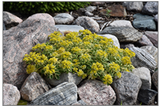
Atlantis Stonecrop in bloom