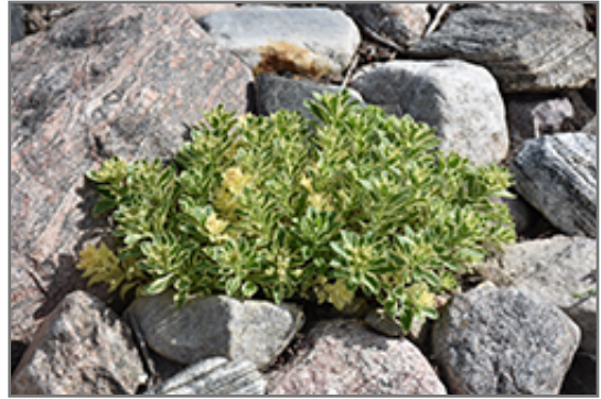
Atlantis Stonecrop