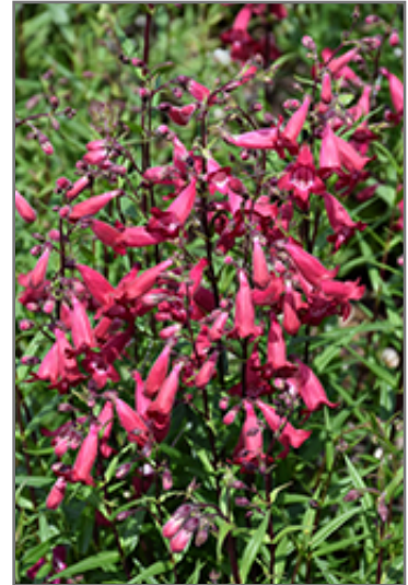
MissionBells Deep Rose Beard Tongue flowers

MissionBells Deep Rose Beard Tongue is recommended for the following landscape applications;