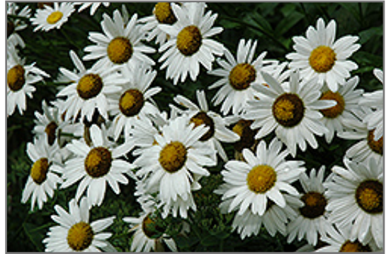
Alaska Shasta Daisy flowers