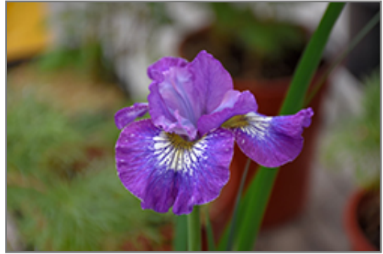
How Audacious Siberian Iris flowers