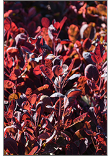
Velveteeny Purple Smokebush foliage

Velveteeny Purple Smokebush makes a fine choice for the outdoor landscape, but it is also well-suited for use in outdoor pots and containers. With its upright habit of growth, it is best suited for use as a 'thriller' in the 'spiller-thriller-filler' container combination; plant it near the center of the pot, surrounded by smaller plants and those that spill over the edges. It is even sizeable enough that it can be grown alone in a suitable container. Note that when grown in a container, it may not perform exactly as indicated on the tag - this is to be expected. Also note that when growing plants in outdoor containers and baskets, they may require more frequent waterings than they would in the yard or garden.