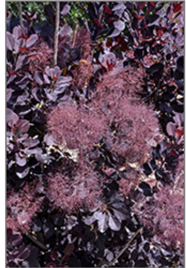
Velveteeny Purple Smokebush flowers