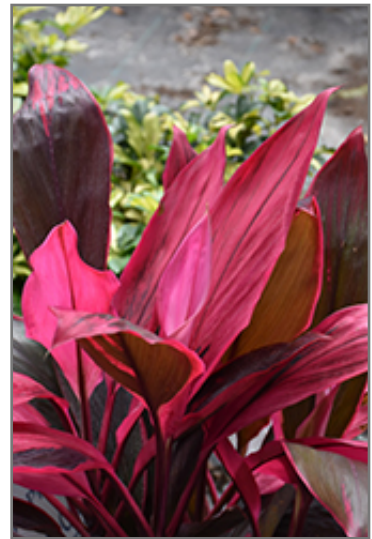
Red Sister Hawaiian Ti Plant foliage