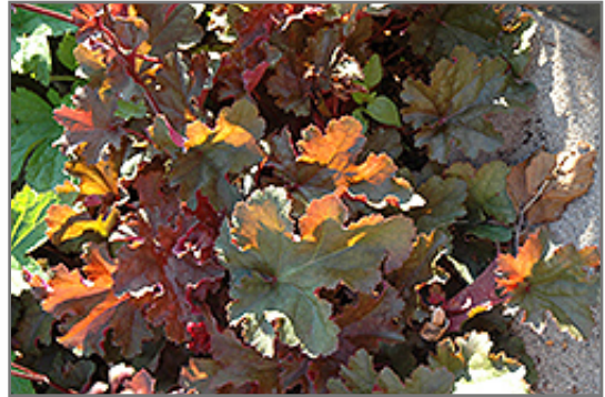
Chocolate Ruffles Coral Bells foliage

Chocolate Ruffles Coral Bells will grow to be about 10 inches tall at maturity extending to 24 inches tall with the flowers, with a spread of 12 inches. When grown in masses or used as a bedding plant, individual plants should be spaced approximately 10 inches apart. Its foliage tends to remain low and dense right to the ground. It grows at a medium rate, and under ideal conditions can be expected to live for approximately 10 years. As an evergreen perennial, this plant will typically keep its form and foliage year-round.