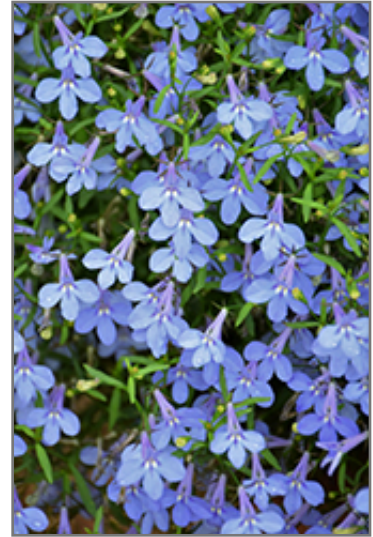
Hot Waterblue Lobelia flowers

Hot Waterblue Lobelia is a fine choice for the garden, but it is also a good selection for planting in outdoor pots and containers. It is often used as a 'filler' in the 'spiller-thriller-filler' container combination, providing a mass of flowers against which the thriller plants stand out. Note that when growing plants in outdoor containers and baskets, they may require more frequent waterings than they would in the yard or garden.