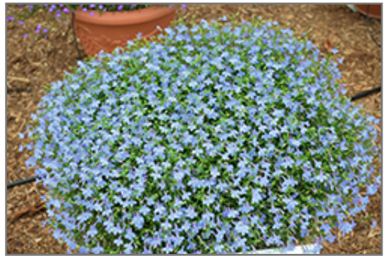
Hot Waterblue Lobelia in bloom