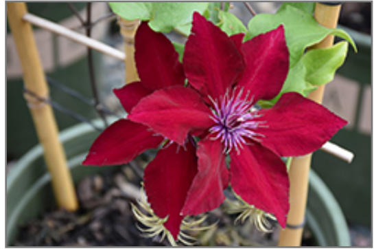
Boulevard Nubia Clematis flowers

Boulevard Nubia Clematis is recommended for the following landscape applications;