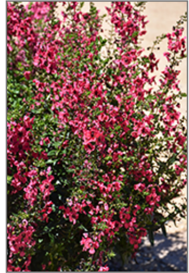
Archangel Cherry Red Angelonia flowers

Archangel Cherry Red Angelonia is an herbaceous annual with an upright spreading habit of growth. Its relatively fine texture sets it apart from other garden plants with less refined foliage.