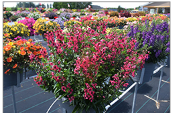
Archangel Cherry Red Angelonia in bloom