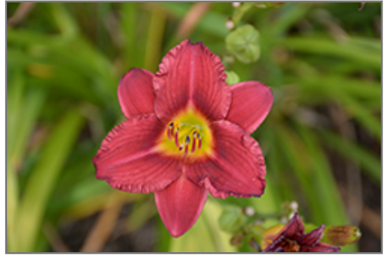
Pardon Me Daylily flowers