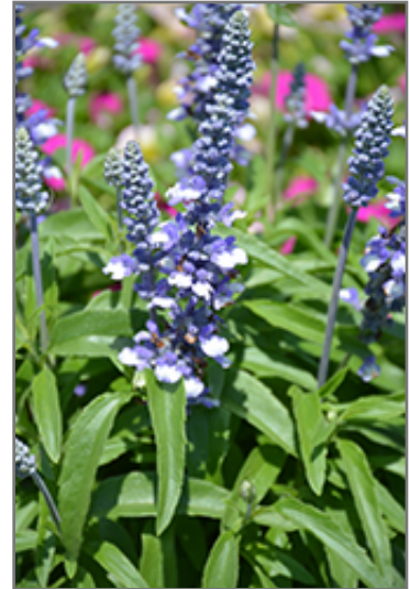
Cathedral Shining Sea Salvia flowers

Cathedral Shining Sea Salvia is recommended for the following landscape applications;