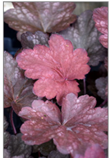
Carnival Candy Apple Coral Bells foliage