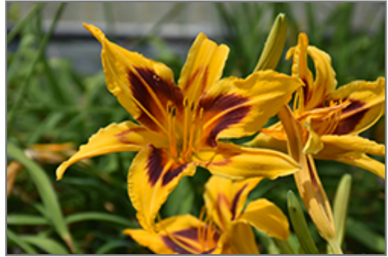
Bonanza Daylily flowers