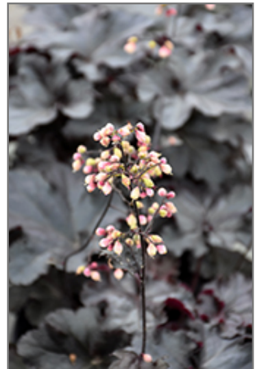
Black Pearl Coral Bells flowers