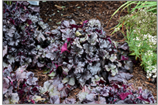
Black Pearl Coral Bells

Black Pearl Coral Bells will grow to be about 10 inches tall at maturity extending to 20 inches tall with the flowers, with a spread of 26 inches. When grown in masses or used as a bedding plant, individual plants should be spaced approximately 20 inches apart. Its foliage tends to remain low and dense right to the ground. It grows at a medium rate, and under ideal conditions can be expected to live for approximately 10 years. As an evergreen perennial, this plant will typically keep its form and foliage year-round.