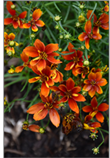
Sizzle And Spice Crazy Cayenne Tickseed flowers

Sizzle And Spice Crazy Cayenne Tickseed is recommended for the following landscape applications;