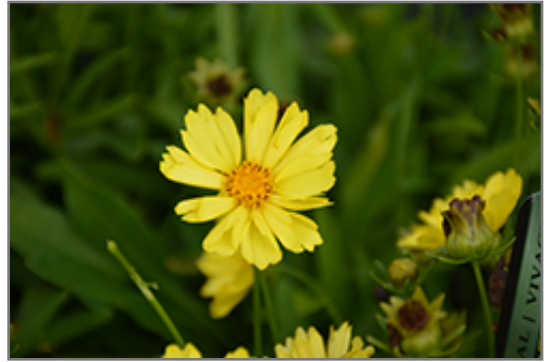
Leading Lady Sophia Tickseed flowers

Leading Lady Sophia Tickseed is recommended for the following landscape applications;