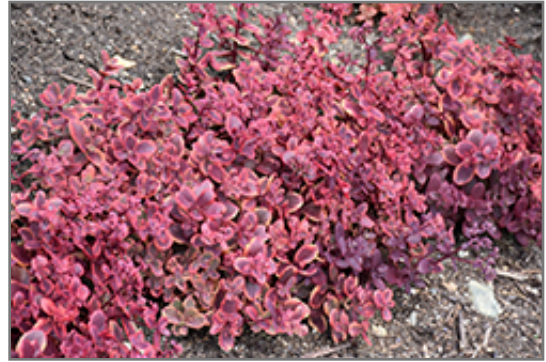
Sunsparkler Wildfire Stonecrop