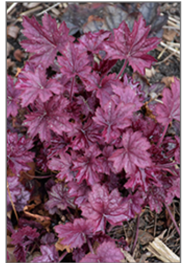
Wild Rose Coral Bells foliage