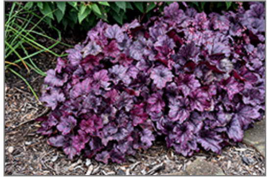
Wild Rose Coral Bells

This is a relatively low maintenance plant, and should be cut back in late fall in preparation for winter. It is a good choice for attracting hummingbirds to your yard. It has no significant negative characteristics.