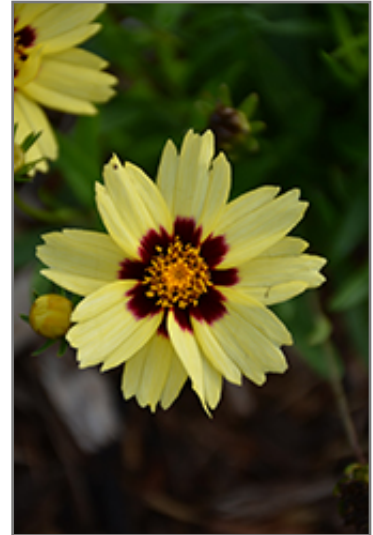
UpTick Cream and Red Tickseed flowers

UpTick Cream and Red Tickseed is recommended for the following landscape applications;