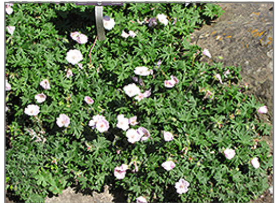
Striated Cranesbill in bloom