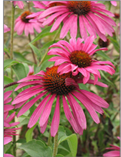
Ruby Star Coneflower flowers