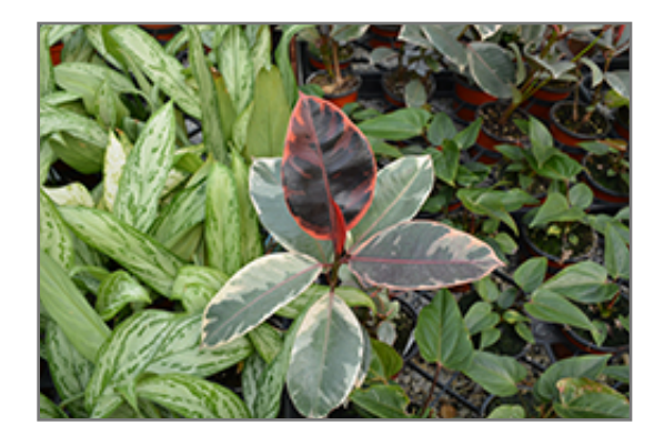
Tricolor Rubber Tree

heeman.ca | 519.461.1416 20422 Nissouri Road Thorndale, ON NOM 2P0 Family owned and operated since 1963. Open year-round.