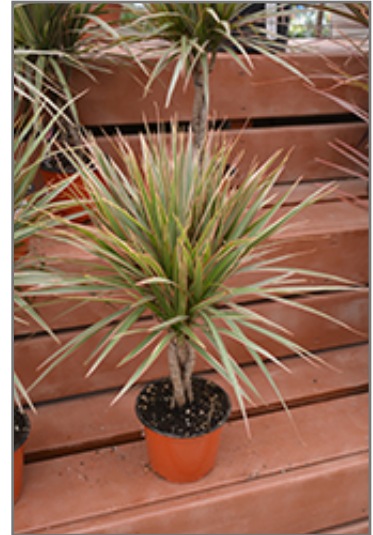
Colorama Dracaena in full

When grown indoors, Colorama Dracaena can be expected to grow to be about 3 feet tall at maturity, with a spread of 24 inches. It grows at a medium rate, and under ideal conditions can be expected to live for approximately 10 years. This houseplant performs well in both bright or indirect sunlight and strong artificial light, and can therefore be situated in almost any well-lit room or location. It does best in average to evenly moist soil, but will not tolerate standing water. The surface of the soil shouldn't be allowed to dry out completely, and so you should expect to water this plant once and possibly even twice each week. Be aware that your particular watering schedule may vary depending on its location in the room, the pot size, plant size and other conditions; if in doubt, ask one of our experts in the store for advice. It is not particular as to soil type or pH; an average potting soil should work just fine.