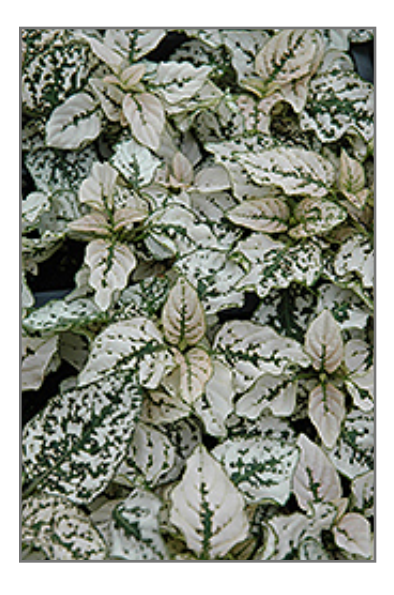
Splash Select White Polka Dot Plant foliage

When grown indoors, Splash Select White Polka Dot Plant can be expected to grow to be about 12 inches tall at maturity, with a spread of 12 inches. It grows at a fast rate, and under ideal conditions can be expected to live for approximately 5 years. This houseplant will do well in a location that gets either direct or indirect sunlight, although it will usually require a more brightly-lit environment than what artificial indoor lighting alone can provide. It does best in average to evenly moist soil, but will not tolerate standing water. The surface of the soil shouldn't be allowed to dry out completely, and so you should expect to water this plant once and possibly even twice each week. Be aware that your particular watering schedule may vary depending on its location in the room, the pot size, plant size and other conditions; if in doubt, ask one of our experts in the store for advice. It is not particular as to soil type or pH; an average potting soil should work just fine.